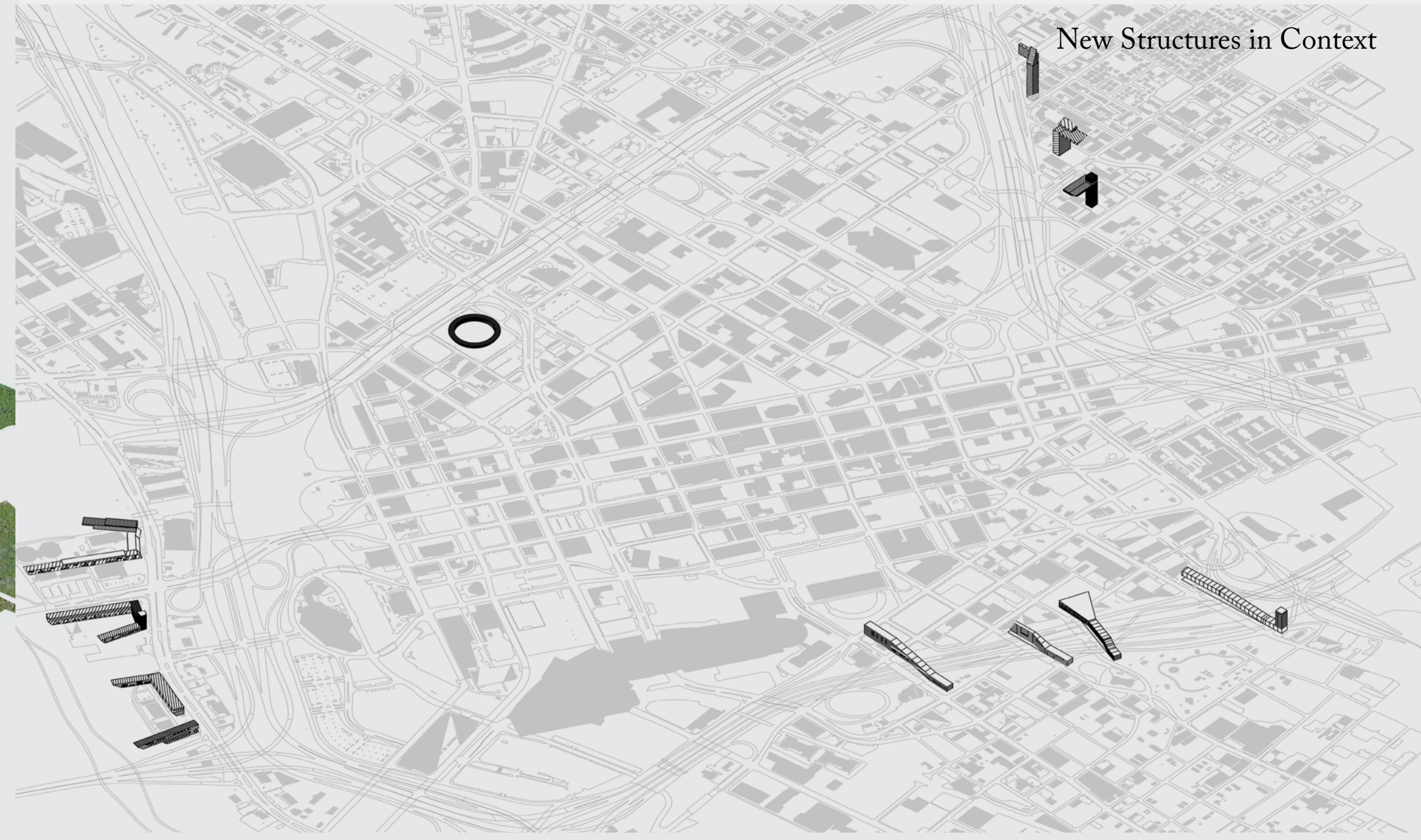
New Structures in Context