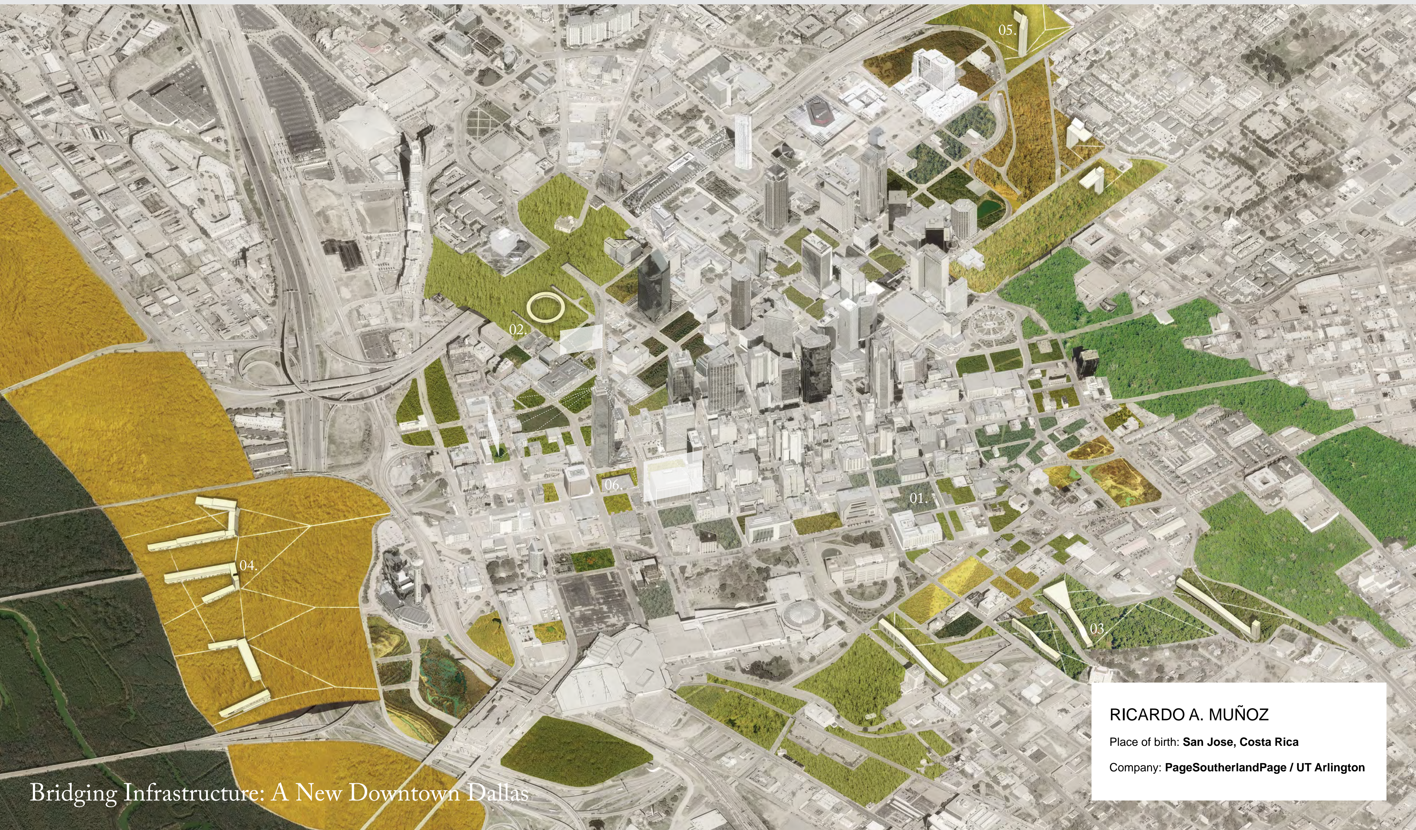
06. Surface Parking Converted to Connection to Tunnels